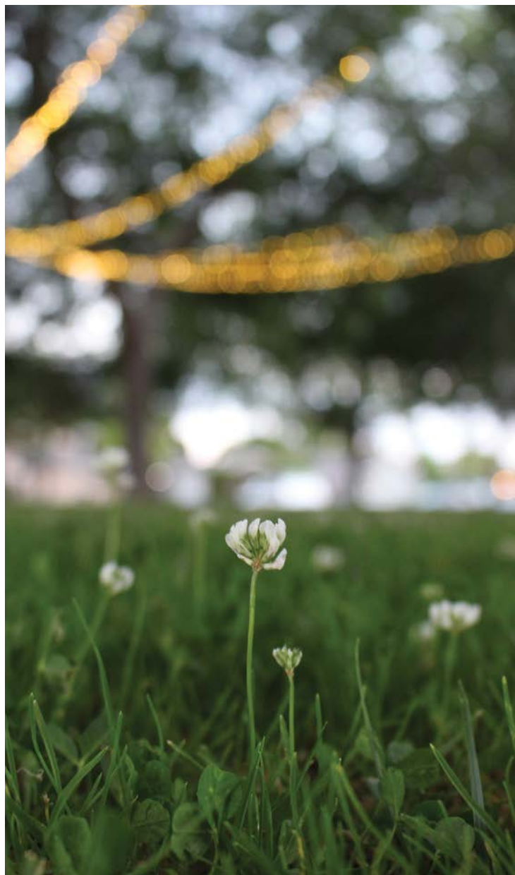
"A Little Bit of Perseverance"