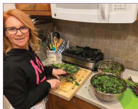
CLIENT PREPARING FOOD FINDERS PRODUCE

staff therapist/coordinator. This new position will allow us to conduct group sessions, follow up on clients' attendance with their therapists, and conduct specialty workshops, just to name a few of his/her duties. We have also applied for a grant to provide our clients with a part-time education counselor.