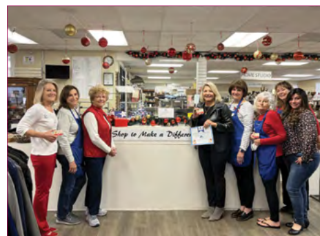
ASSISTANCE LEAGUE HUNTINGTON BEACH HOLIDAY DONATION OF FOOD GIFT CARDS

Pathways will also be welcoming additional staff. We've been blessed with a grant from the James Eaton Foundation to provide a part-time