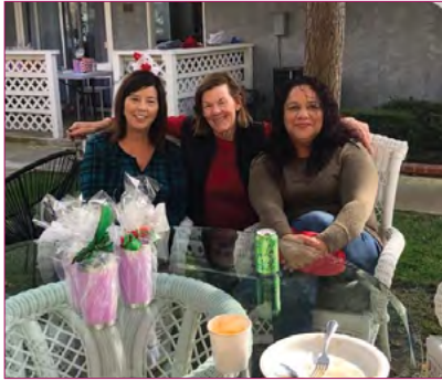
MENTORS GATHERED AT WINTER WELLNESS EVENT

WE HAVE RE-ESTABLISHED IN-PERSON GATHERINGS THIS PAST YEAR. A FEW OF THE EVENTS OUR CLIENTS ENJOYED WERE GRADUATION CELEBRATIONS, QUARTERLY BIRTHDAY BASHES, A WINTER WELLNESS EVENT, AND MENTOR AND CLIENT SUMMER GATHERINGS.