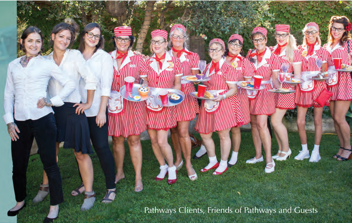
Pathways Clients, Friends of Pathways and Guests

20 th Annual Event "Cruisin' Route 66 in the Park" Motors To a Record-Breaking $600,000 for Pathways!